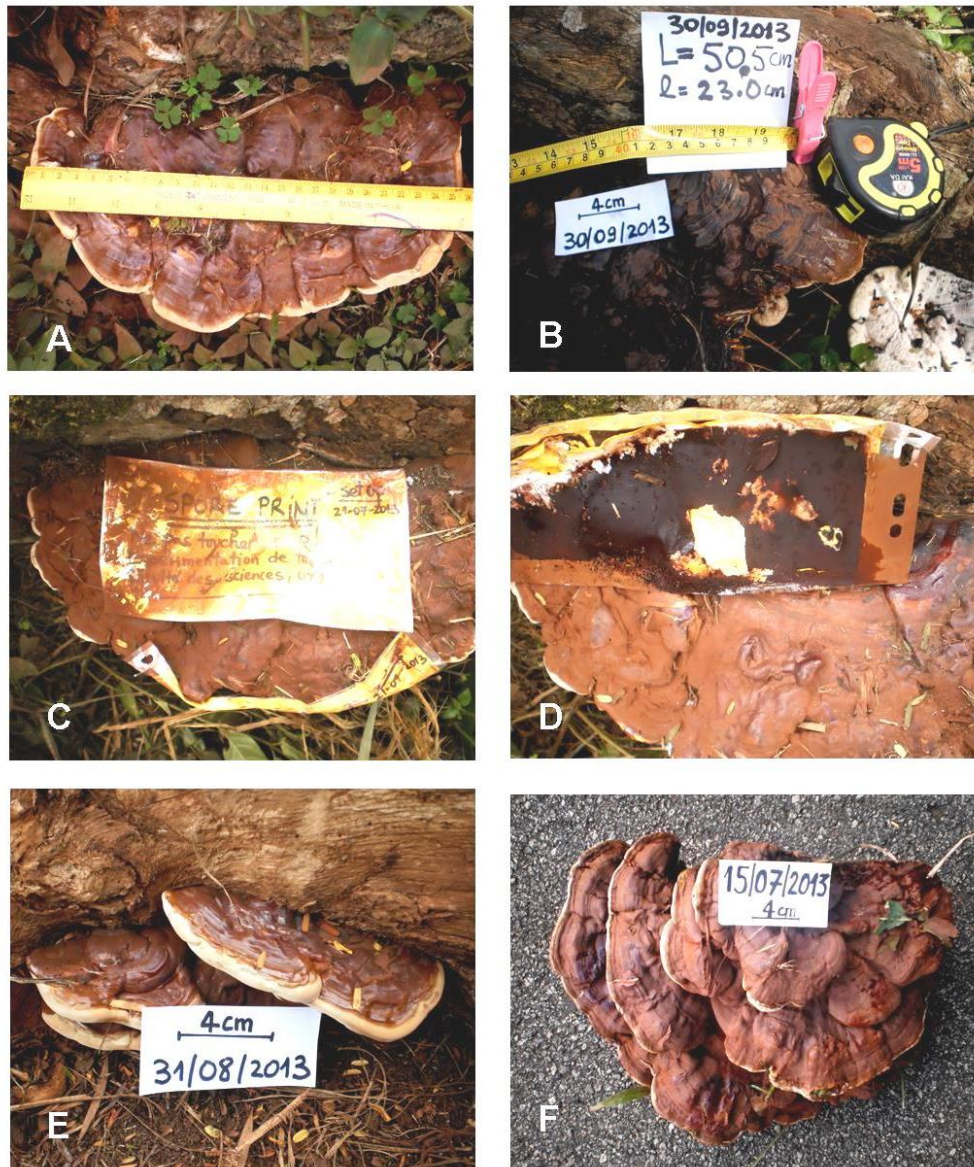
Fig. 1 – Monitoring growth and spore-print production of Ganoderma resinaceum on natural substrate (mostly dead wood). A-B Measurements of length and width of sporocarp. C-D Spore-print produced by sporocarp on natural substrate. E Young sporocarps in active growth. F Sporocarp cease producing spore-print once collected from substrate. Scale bars as shown on the figures.

other criteria, that they should be of equal size or nearly so at the launching of the study. Also, a sporocarp was selected only when there was no other fungal species on the same substrate in order to avoid possible negative effects of eventual mycoparasitism or fungal competition. Length and width of sporocarps were measured (Figs 1A-B) every 2 weeks over more than 250 days (Table 1 & 2) and the measurements correlated with time in days of growth, in order to compute for the first time since the first description (Boudier 1889) of G. resinaceum , the correlation equation Y = a + bX (Mc. Donald 2014; Parker 1991) between length of sporocarp and time of growth on the one hand, and width and time of growth on the other hand. The natural production of spores as spore-prints was equally closely monitored by attaching with tailor needles pieces of contrast paper (Figs 1C-D) on the upper and lower sides of the 6 basidiocarps (6 replicates) at different sites (Table 3) in Cameroon in order to determine the time of growth corresponding to the beginning and end of production of spore-prints on natural substrate on the field. The spore-print colour was determined according to the colour chart of Kornerup & Wansher (1978).