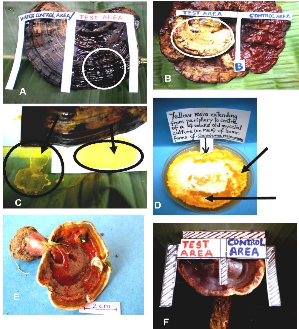
Figure 1. A: Ethanol test exuding a \pm bright shiny varnished and sticky resin (“test area”) on pileus of a dry basidiocarp (exsicattum) of G. resinaceum ; B: ethanol test showing a spot of yellowish resin (“test area”) on fresh basidiocarp of G. resinaceum ; C: ethanol test exuding yellowish to yellow resin on exsicattum of G. resinaceum ; D: yellowish zones occurring in mycelial cultures as a key cultural feature of G. resinaceum ; E: a strain of G. lucidum from central Africa tested; F: a different strain of G. lucidum (exsicattum) tested as positive control.

The above mentioned results clearly show that ethanol could henceforth be considered as a safer, quicker and more reliable substitute to the “match flame” test previously described by several authors including Ryvar den and Melo (2014), Ryvar den (2000, 2004), Núñez and Ryvar den (2000) and Breitenbach and Kränzlin (1986), as a reagent to reveal yellowish resin on the pileus of G. resinaceum . Therefore, a positive ethanol test combined with the above mentioned mycelial culture features stand as outstanding in the process of identification of G. resinaceum , but however still need additional macro- and micromorphological investigations of the specimens tested in order to confirm identification.