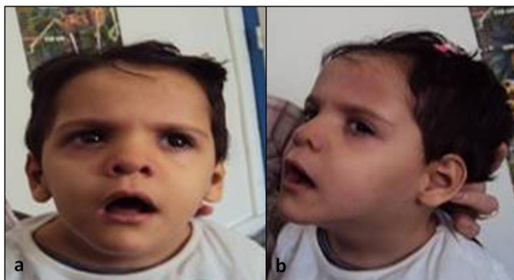
Figure 1 Photographs of the patient at age of 2 years and 3 months, frontal (a) and lateral (b) view. Note the tall forehead, anteverted nares, thin upper lip, anteverted ears and long philtrum.

The karyotype was normal and presence of Angelman syndrome was excluded by methylation specific PCR (MSPCR) (data not shown). In the absence of any etiological diagnosis, array-CGH analysis identified a 1.45 Mb deletion at 19p13.2p13.12 in the patient