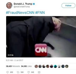
Figure 3 : #FraudNewsCNN

The issues raised by post-truth's techniques and rhetoric meet the concerns raised by Colin Crouch when describing the situation of our democratic countries in what he calls a post-democratic era: "Under this model, while elections certainly exist and can change governments, public electoral debate is a tightly controlled spectacle, managed by rival teams of professional experts in the techniques of persuasion, and considering a small range of issues selected by those teams. [...] Behind this spectacle of the electoral game politics is really shaped in private by interaction between elected governments and elites which overwhelmingly represent business interests." 33 Being a businessman and a Reality TV star, Donald Trump interestingly masters the art of spectacle as well as represents himself and other business interests at play in the political game. Telling false truths, deceiving and smearing the opinion is thus nothing negative, it is part of the "spectacle", a sort of political wrestling in which the US President already illustrated himself: "the virtue of all-in wrestling is that it is the spectacle of excess" 34 .