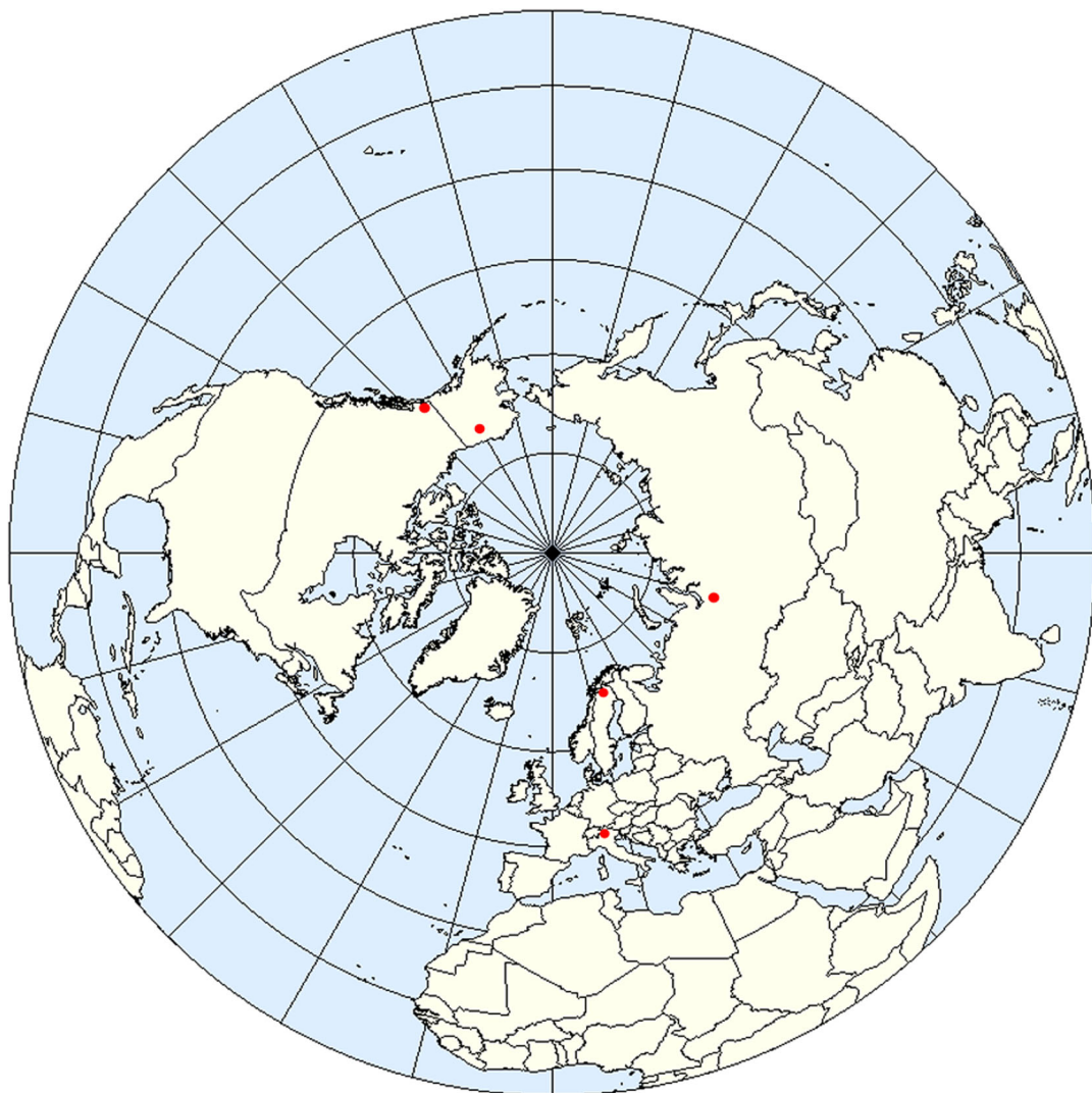
Figure 2 Circum arctic sampling map (Northern Hemisphere polar Lambert Azimuthal projection) after original of Sean Baker on which the red dots indicate the areas where we collected specimens of Alpinobombus .

alkanes C10-C40 was injected as a standard for calculation Kovats indices (KI). KI were calculated with GC Kovats 1.0 according to the method described by Dellicour & Lecocq (2013).