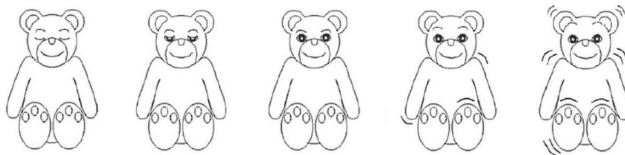
Fig. 2 Teddy bears' scale adapted from the Self-Assessment Manikin Scale

To determine the number of children to include, we relied upon Rueda et al. [12], showing a global sitting performance of an overall RT of 931 \pm 42 ms in 6-years-old children born at term and 833 \pm 123 ms in 7-years-old children born at term. Because children born prematurely are usually considered to have about a 1-year delay for learning abilities, we calculated that to demonstrate a catch-up related to the mobility condition, sitting being the reference, for each attention component, with an alpha risk of 0.00625 (Bonferroni correction for the number of tests) and a power of 0.80, 24 children would be needed in each group (Power and Precision™ V4, Biostat Inc., Englewood, NJ, USA 2001).