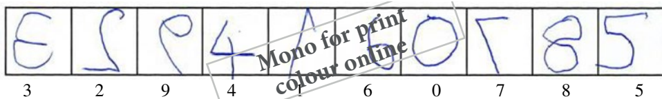
Figure 1. An example of a series of the 10 digits written with the (preferred) right hand by a 5 years 10 months-old girl (the writings of 3, 2, 9, 1 and 7 are reversed).