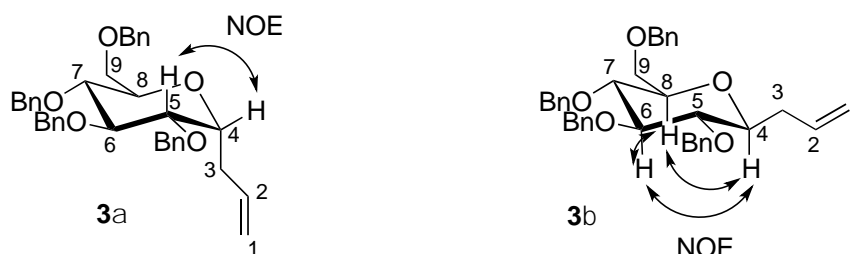
Figure 1: NOE correlations in 3 \alpha and 3 \beta . Atom numbering is consistent with 3 \beta chemical name and for clarity it is also used for 3 \alpha .

equatorial configuration of these two protons and thus the stereochemistry assigned for 3 \alpha (Figure 1). For the minor compound, the NOESY-spectrum showed a correlation between H8, H6 and H4, corroborating the axial -configuration of these three axial protons and therefore the stereochemistry of 3 \beta .