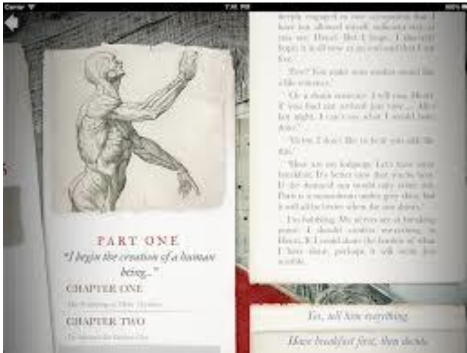
Fig. 4: Screenshot of the conclusion of Chapter 2. Morris, Dave. Frankenstein . London: Profile Books and Inkle, 2012. Application for Mac OS. Accessed on 12 July 2019. https://www.inklestudios.com/frankenstein/

Morris's Frankenstein is divided into six sections and into chapters, each chapter ending with a question followed by two or three answers marked in italics. As the reader activates the chosen page, the chapter begins to assume a fixed form that can be re-read through a scroll function. A new configuration is possible by enabling a "reset" function in the application.