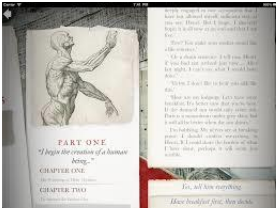
Fig. 4: Screenshot of the conclusion of Chapter 2. Morris, Dave. Frankenstein . London: Profile Books and Inkle, 2012. Application for Mac OS. Accessed on 12 July 2019. https://www.inklestudios.com/frankenstein/

Morris's Frankenstein is divided into six sections and into chapters, each chapter ending with a question followed by two or three answers marked in italics. As the reader activates the chosen page, the chapter begins to assume a fixed form that can be re-read through a scroll function. A new configuration is possible by enabling a “reset” function in the application.