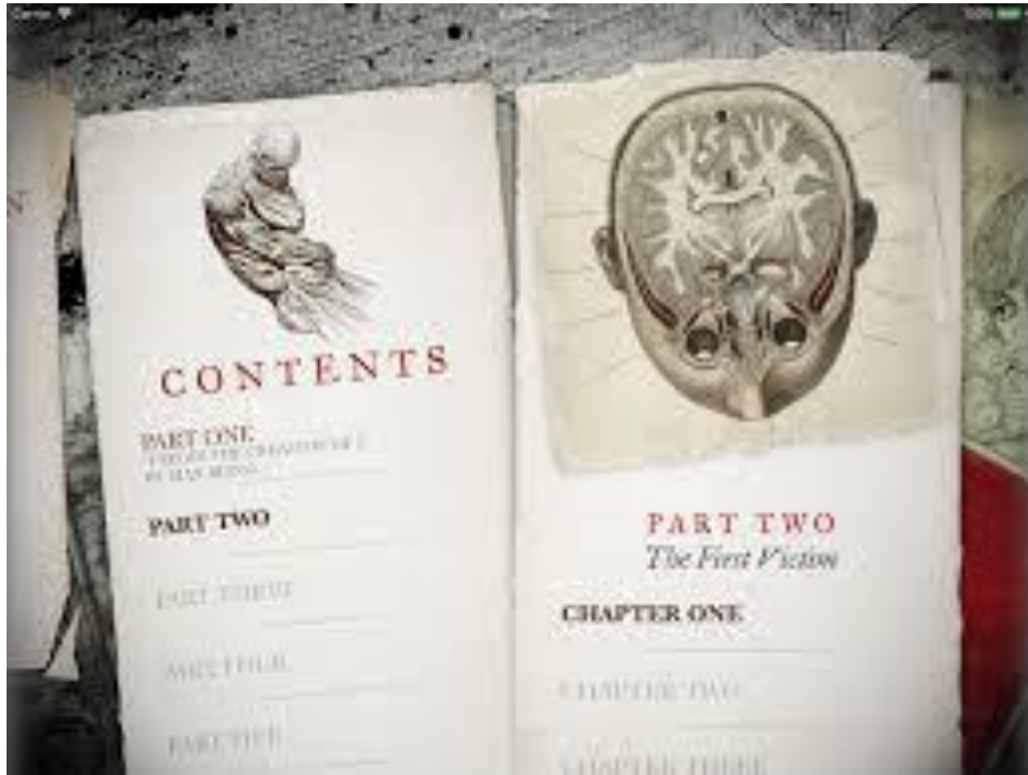
Fig. 2: Screenshot from the table of contents with reproduction of anatomical drawings. Accessed on 12 July 2019. https://www.inklestudios.com/frankenstein/