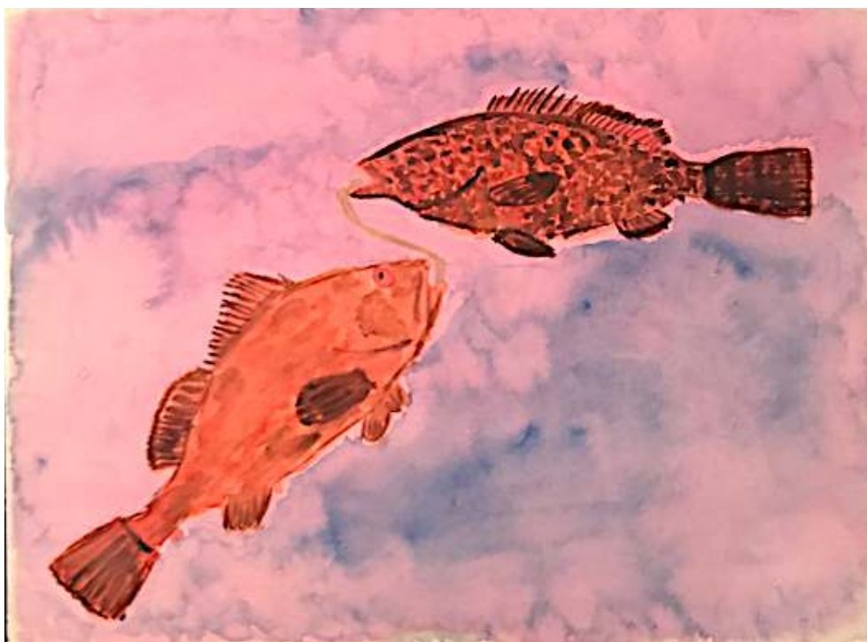
TWO FISHES IN THE CLOUDS