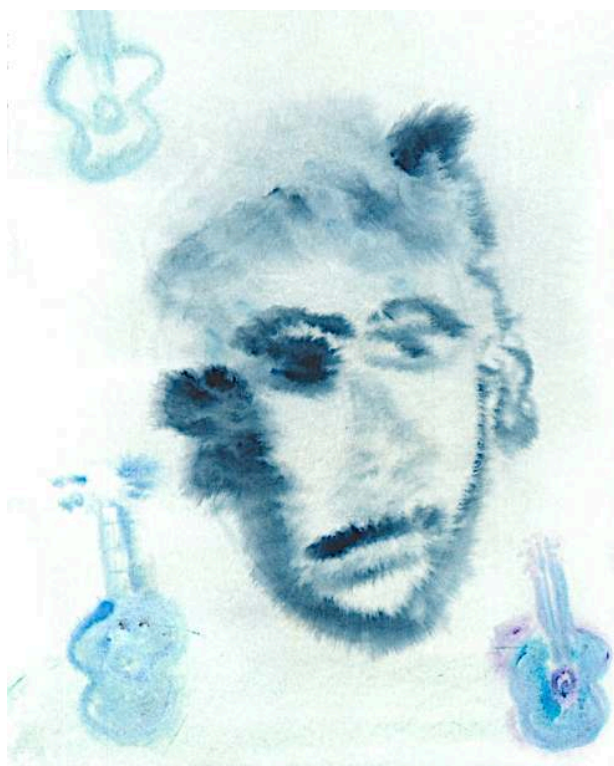
FACE WITH GUITAR