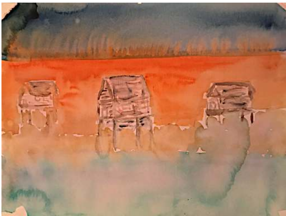
THREE BEACH HOUSES UNDER STORM CLOUDS