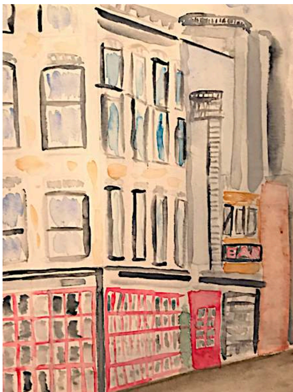
BAR IN SOHO