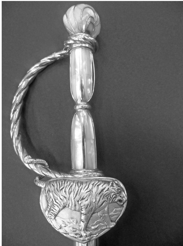
Figure 3.1 Mellerio dits Meller jewellery house Jean-Louis Curtis's Academician sword hilt, reproducing the design of Blake's 'Tyger' (1986–87), Orthez, Médiathèque Jean-Louis Curtis.

For a long time Blake was known in France only by scholars, writers and translators, people who read Blake professionally and admired him greatly. This admiration is expressed in a number of ways: in 1986, when the novelist Jean-Louis Curtis (born Louis Laffitte, 1917–1995) was elected a member of the French Academy ( Académie française ),