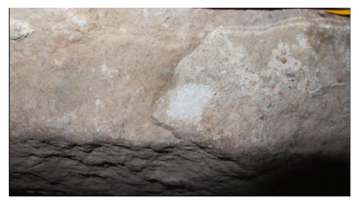
Fig. 2. Cleaned surface where samples were taken from the inscription for elemental and stable isotope analysis.