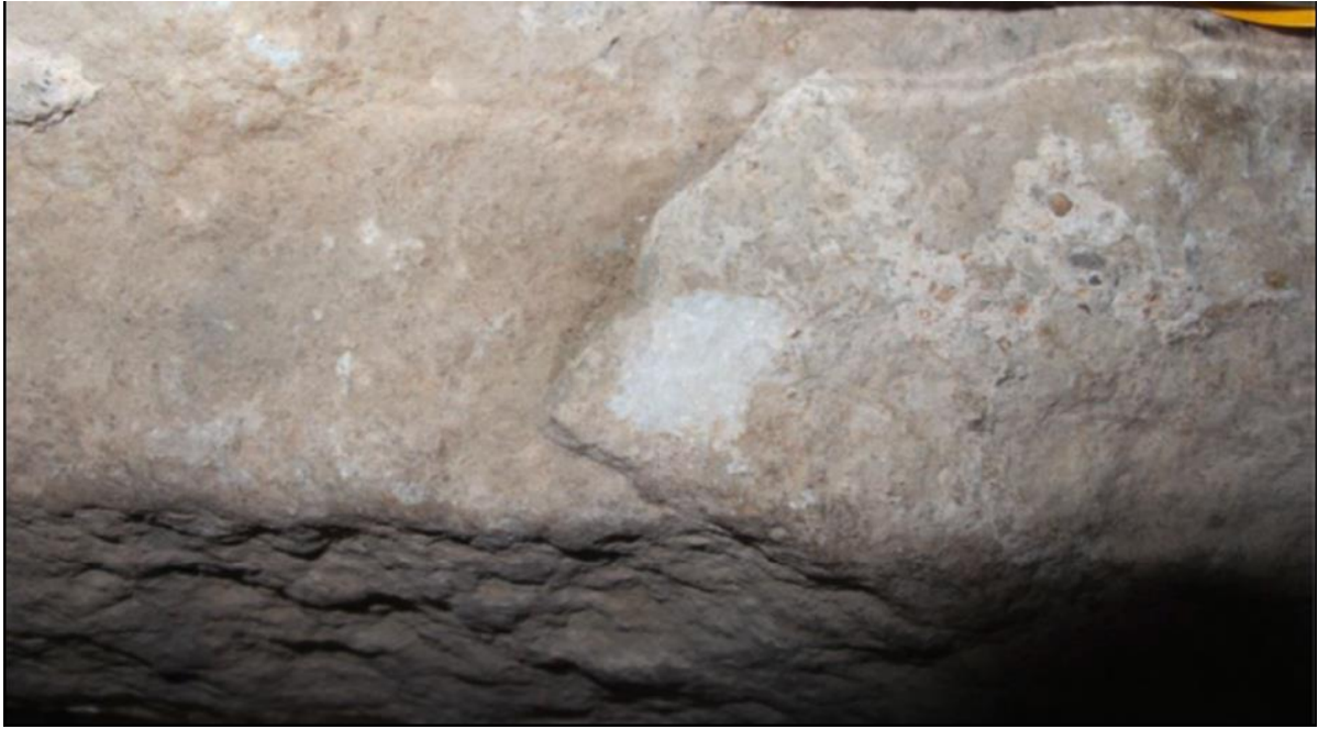
Fig. 2. Cleaned surface where samples were taken from the inscription for elemental and stable isotope analysis.