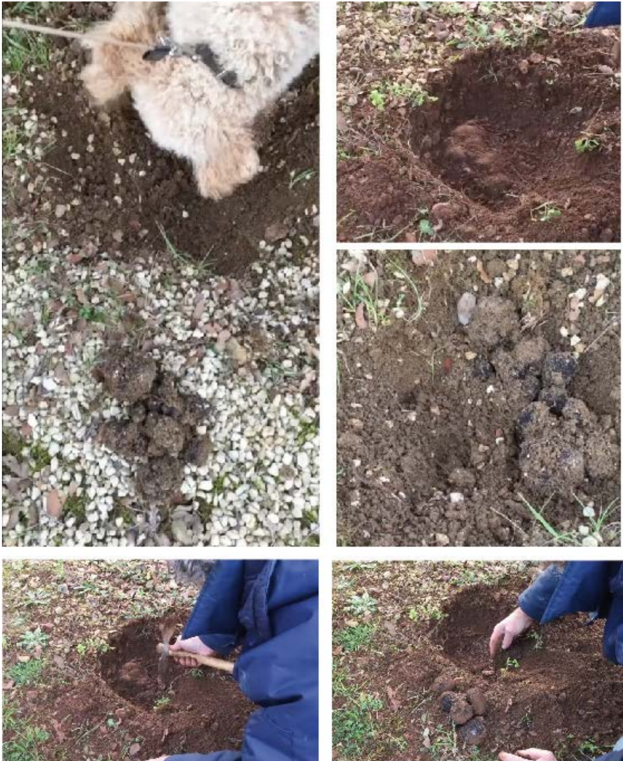
Fig. 2. Pictures showing the truffles harvested in holes Fig. 2. Immagini che mostrano la raccolta dei tartufi nei pozzetti