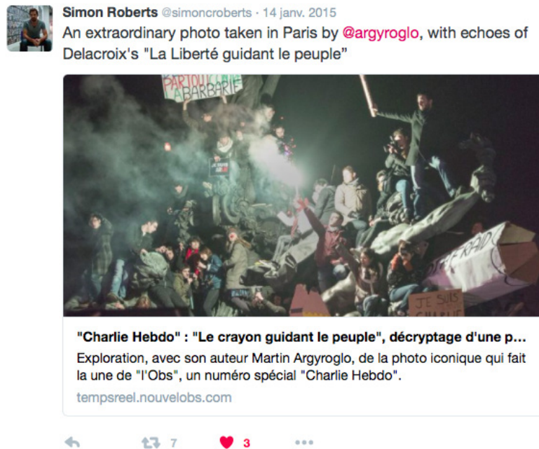
Image 3 - Multimodal tweet containing a card representing a broad summary