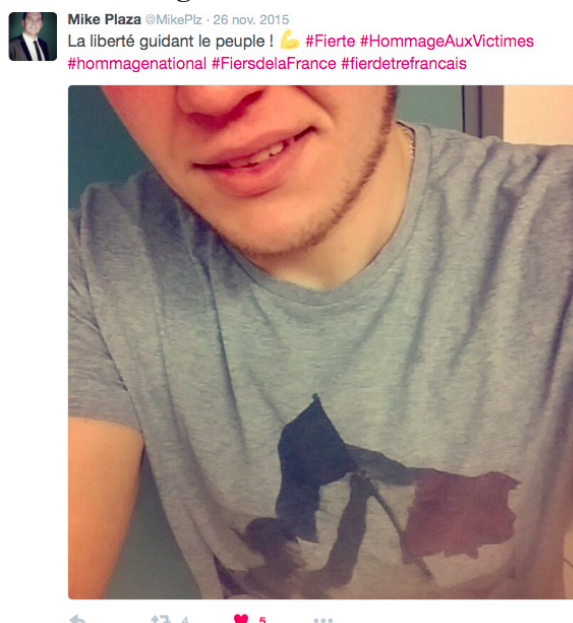
Image 8 - Tribute in selfie