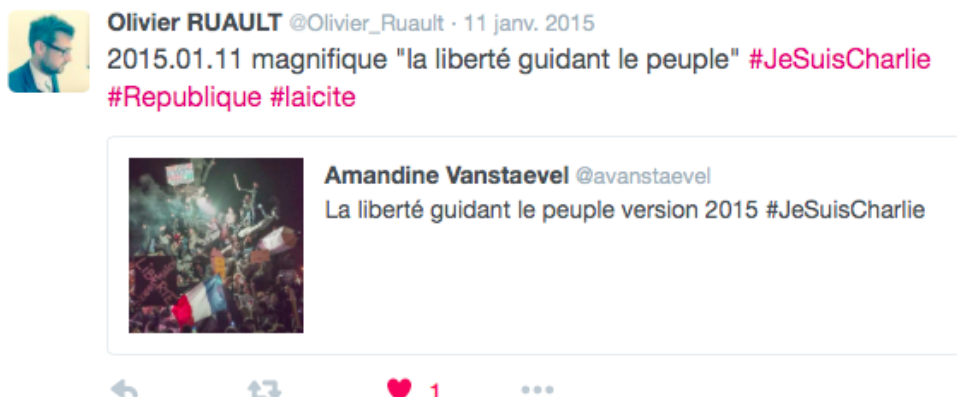
Image 5 - Multimodal tweet created by tweet quotation

tweet, retweeting or creating a new tweet and mentioning the sign “RT” (retweet), often accompanied with the sign “via”, thus quoting a tweet that then appears in a specific insert.