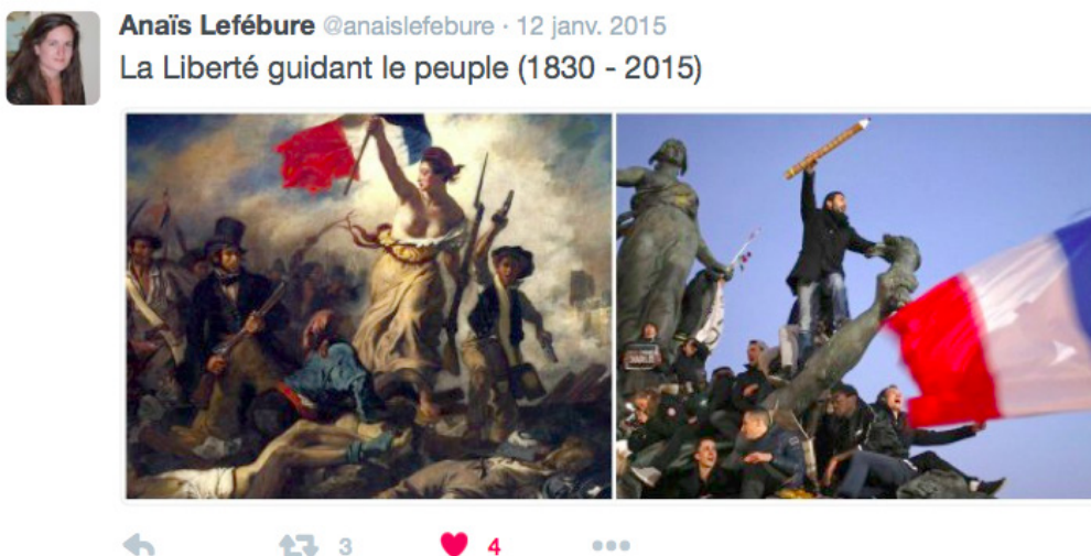
Image 7 - Compilation for the purpose of comparison

The circulation mechanisms are represented through publications of these three reformulations (largely in original publications and thanks to the processes of intermediality and of intramediality) and also through compilations made by montages where the original painting is placed next to the new version. Here is the illustration: