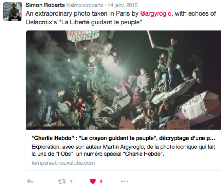
Image 3 - Multimodal tweet containing a card representing a broad summary