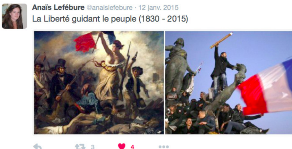
Image 7 - Compilation for the purpose of comparison

The circulation mechanisms are represented through publications of these three reformulations (largely in original publications and thanks to the processes of intermediality and of intramediality) and also through compilations made by montages where the original painting is placed next to the new version. Here is the illustration: