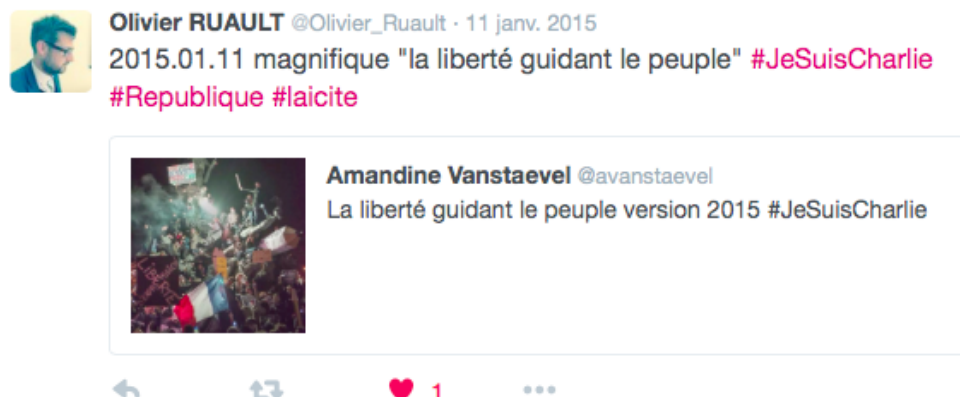
Image 5 - Multimodal tweet created by tweet quotation

tweet, retweeting or creating a new tweet and mentioning the sign “RT” (retweet), often accompanied with the sign “via”, thus quoting a tweet that then appears in a specific insert.