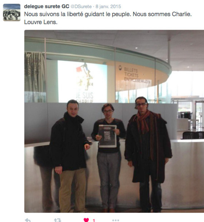
Image 2 - Multimodal tweet with a digital photo of a scene taking place in the Louvre museum in Lens

Let us specify that tweets taken in consideration highlight either directly a visual or audiovisual content or an URL link referring to an image (fixed or animated image generally present on another socio-digital network). Furthermore, it is important to insist on the fact that the multimodal tweets we encountered involve technical or material complexity (depending on the media) and semiotic complexity (Image 2 shows this complexity).