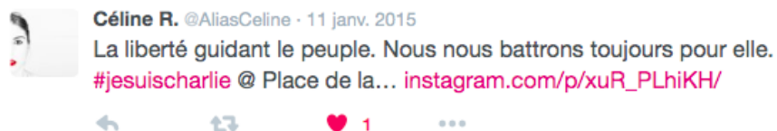
Image 4 - Multimodal tweet containing a URL link referring to a photograph on Instagram

Instagram gives its users the possibility to automatically publish content on another network. However, on Twitter only a link to Instagram will appear, and not the visual content. The automation of a publication could also lead to a shortened tweet – as in the following example –, which is not really ideal as far as the clarity of information is concerned.