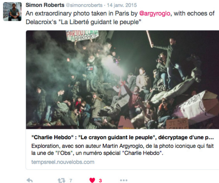
Image 3 - Multimodal tweet containing a card representing a broad summary