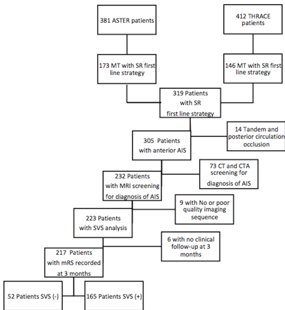
Figure 1 Inclusion flowchart. AIS, anterior ischemic stroke; ASTER, Contact Aspiration versus Stent Retriever for Successful Revascularization; CTA, CT angiography; mRS, modified Rankin Scale; MT, mechanical thrombectomy; SR, stent retriever; SVS, susceptibility vessel sign; THRACE, THrombectomie des Artères Cerebrales.

The primary outcome was global disability, assessed by overall distribution of the mRS score at 90 days (shift analysis combining