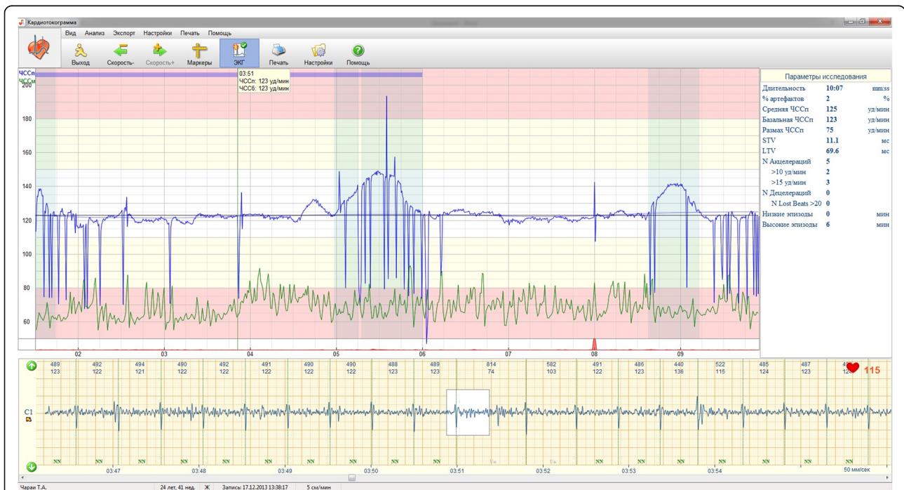
Fig. 3 RR time series obtained from NI-FECG recording (case 2) transformed to “beat-to-beat” derived FHR (blue trace). Noticed the presence of multiple dropped beats characterized by local drops in the heart rate