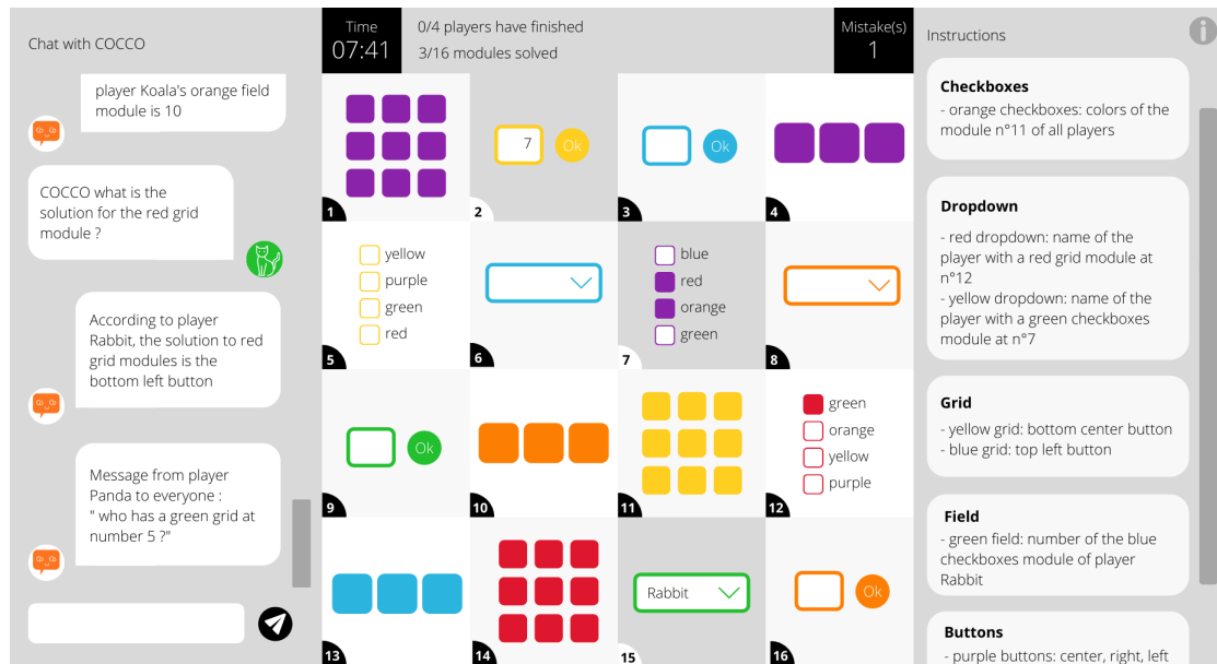
Figure 1: Proposed interface of the experimental platform