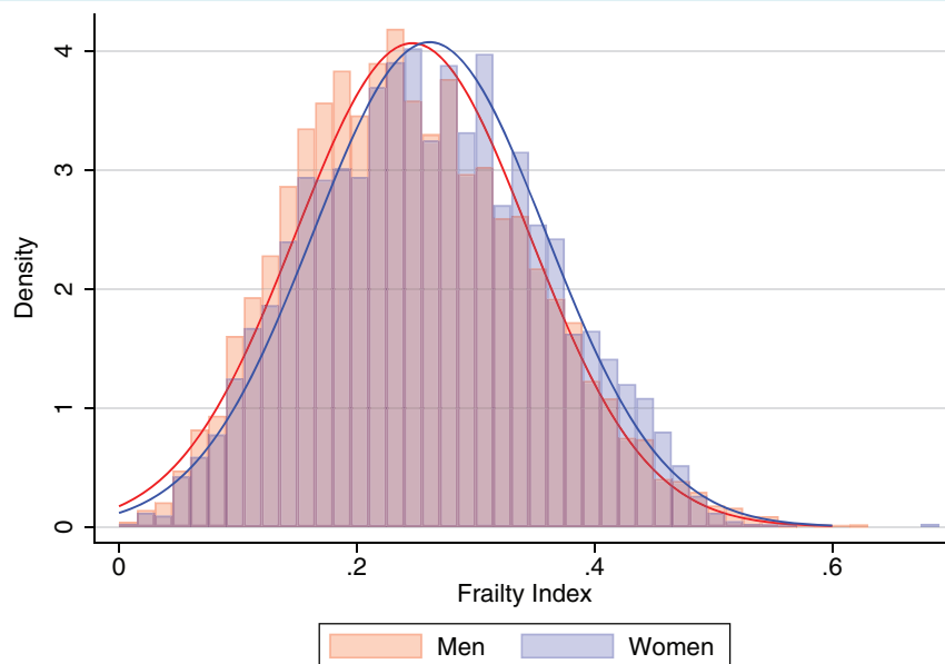
Figure 1 Density distribution of frailty index in men and women.