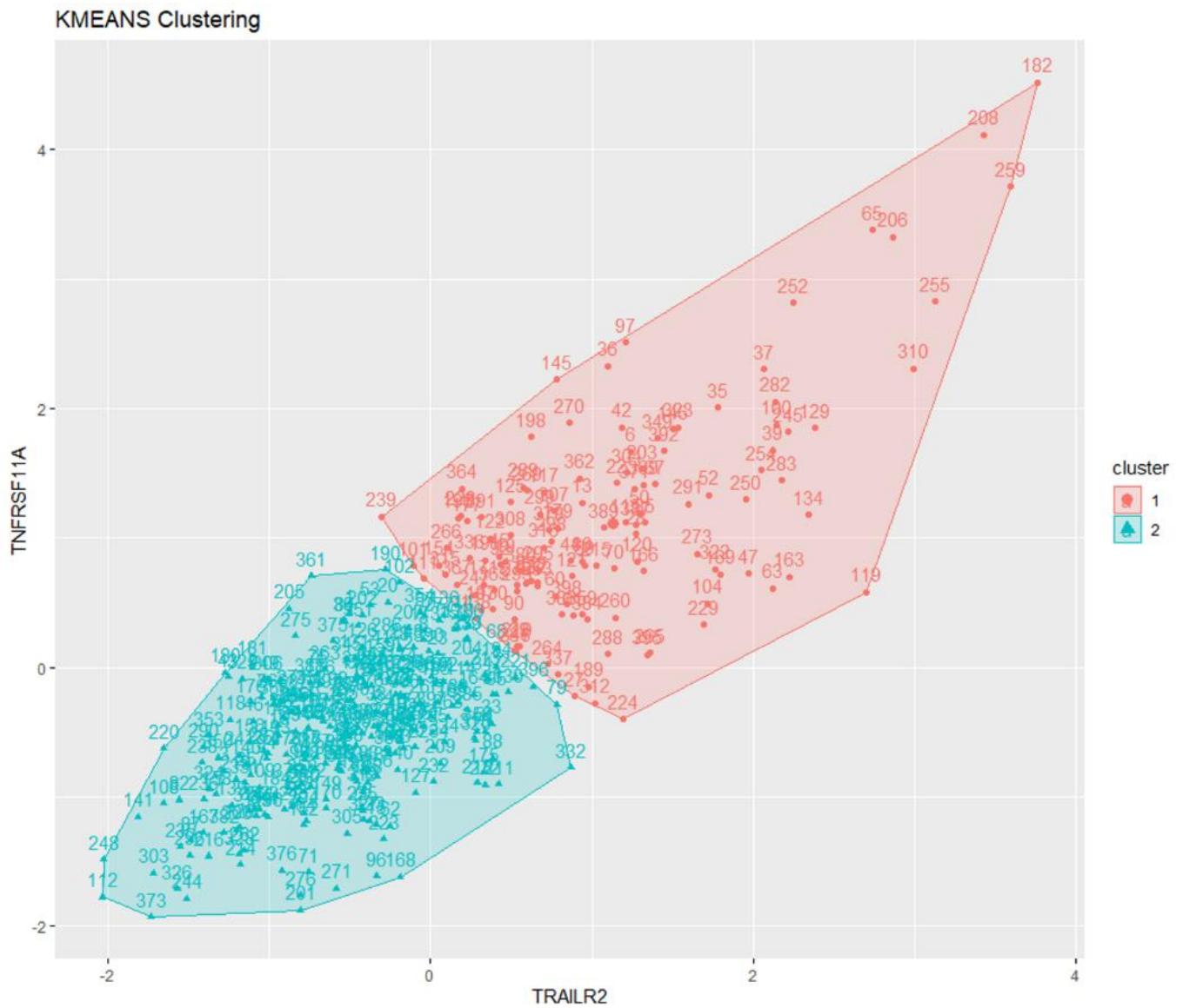
Figure 2. Factorial patients' distribution according to 2-clusters k-means partitioning

using TRAILR2 and TNFRSF11A protein biomarkers.