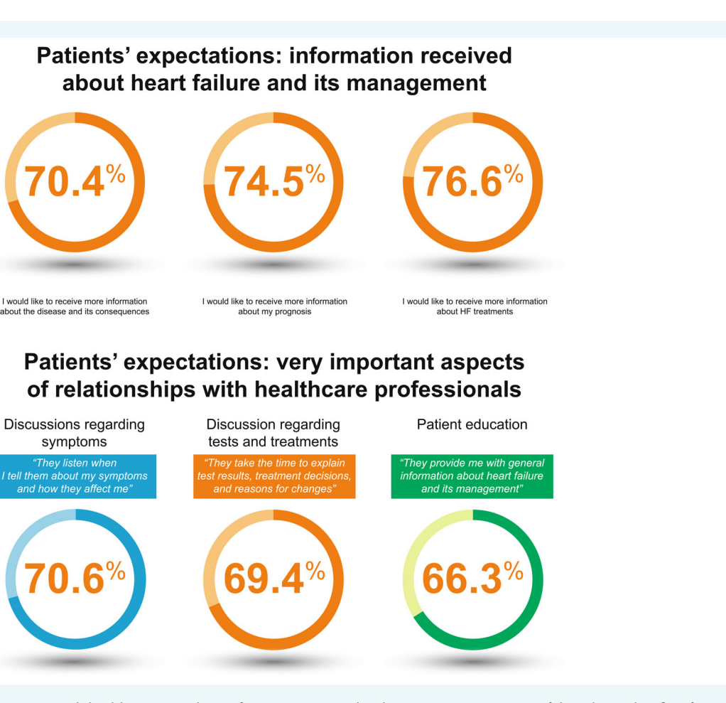
Figure 2 Patients' expectations towards healthcare providers: information received and very important aspects of the relationship. Satisfaction with information received about heart failure (HF) and its management: percentages for 'strongly agree' or 'agree' (vs. 'neutral', 'disagree' or 'strongly disagree'). Importance of different aspects of relationships with healthcare professionals: percentages for 'very important' (vs. 'moderately important', 'neither important nor unimportant', 'moderately unimportant' or 'very unimportant').

The median number of prescribed pills taken per day was 8 (range 2–25), including 6 (range 1–25) for heart disease. Most respondents (81.6%) reported they had no difficulties taking their medications as prescribed; however, 28.6% reported they sometimes forgot to take them, and 21.4% felt they had to take too many pills.