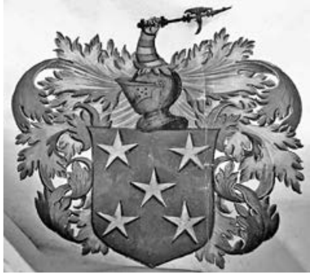
Fig. 2. Coat of arms granted to Claude Callot, as depicted on his letter of ennoblement, 1584 ( Archives municipales de Metz , ii 158, no. 2)