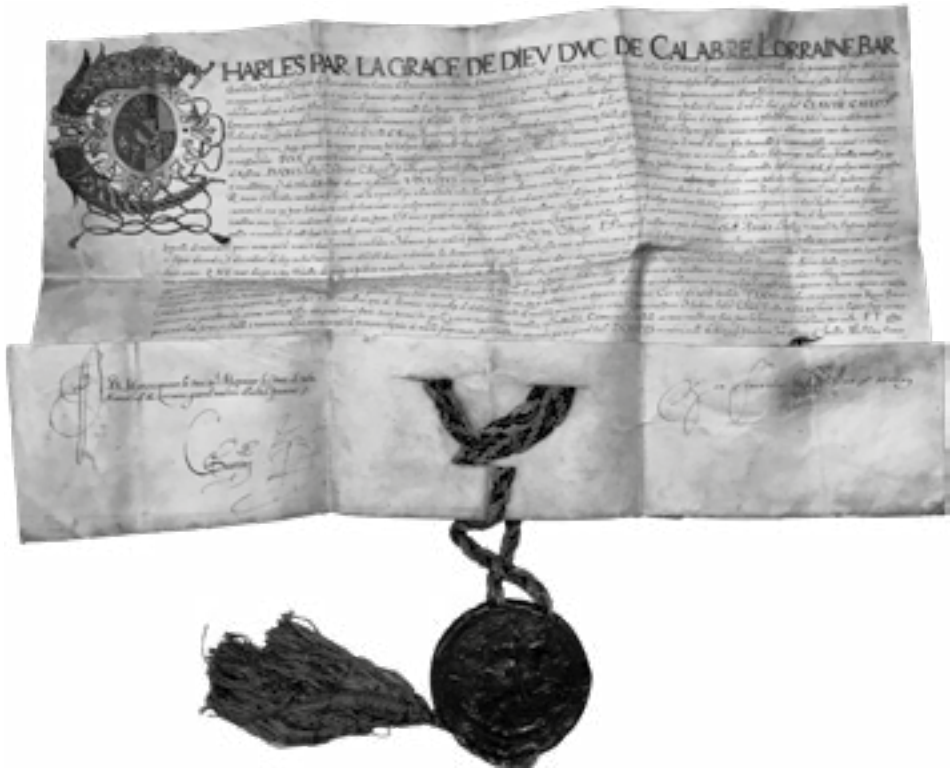
Fig. 1. Letter of ennoblement for Claude Callot, 1584 ( Archives municipales de Metz , ii 158, no. 2)

was René II of Lorraine (r. 1473-1508), however, who first developed a princely policy of integrating new elites into the Second Estate. 2 Hitherto insignificant (some thirty ennoblements are documented prior to 1473), the practice then expanded significantly during the reigns of Antoine (r. 1508-1544) and Charles III (r. 1545-1608). 3 As else-