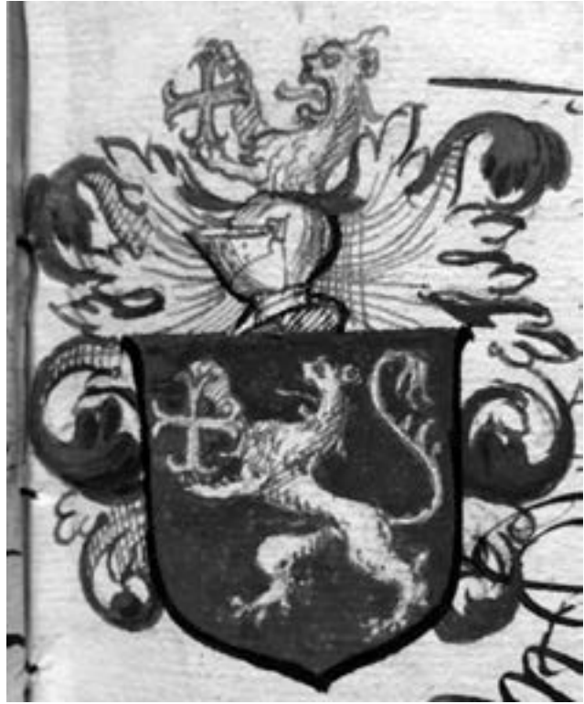
Fig. 6. Coat of arms with heraldic lion drawn by Didier Richier, from the register of the 'Chambre des Comptes' of Lorraine ( Archives départementales de Meurthe-et-Moselle, Nancy, B 186, fol. 34r )