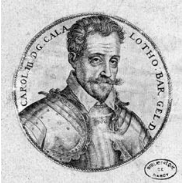
Fig. 4. Duke Charles III of Lorraine (engraved portrait, Pierre Woeiriot de Bouzey, 1591; coll. Bibliothèque de Nancy, P-TS-ES-00236)

and the quality of the ancestors were essential and guaranteed the pre-eminence of families of more ancient standing. 37