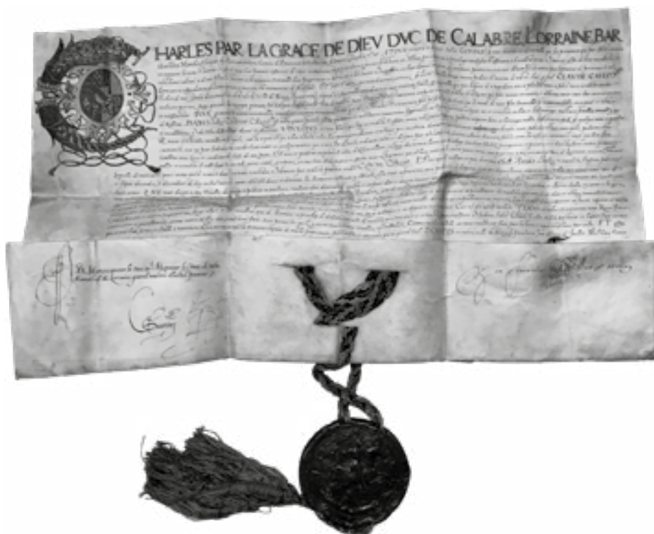
Fig. 1. Letter of ennoblement for Claude Callot, 1584 ( Archives municipales de Metz , ii 158, no. 2)

was René II of Lorraine (r. 1473-1508), however, who first developed a princely policy of integrating new elites into the Second Estate. 2 Hitherto insignificant (some thirty ennoblements are documented prior to 1473), the practice then expanded significantly during the reigns of Antoine (r. 1508-1544) and Charles III (r. 1545-1608). 3 As else-