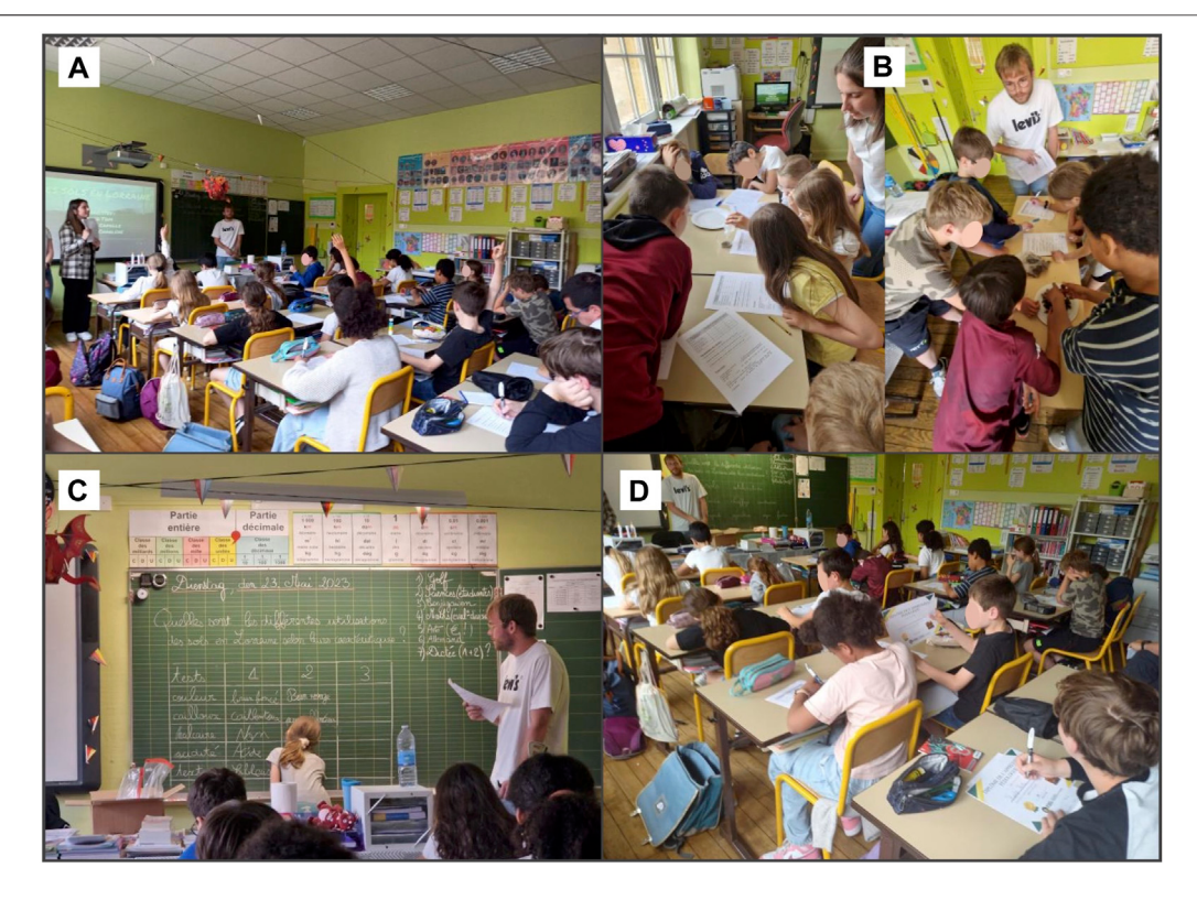
FIGURE 3 | In-class activities. (A) Correction of the grid. (B) Observations and manipulations. (C) Synthesis on the board. (D) Distribution of the diploma.

(that can be translated as "It's not rocket science"), which deals with science popularization for children. The video shows three types of land use in Lorraine (field, orchard, and forest) and describes the three related soils in terms of color, texture, etc. (Figure 2). As the video is shown, pupils fill in a questionnaire to help them identify important information (the soil under forest cover is sandy, for example). At the end of the viewing, students proceed with a correction to check that the correct information has been recorded (Figure 3A).