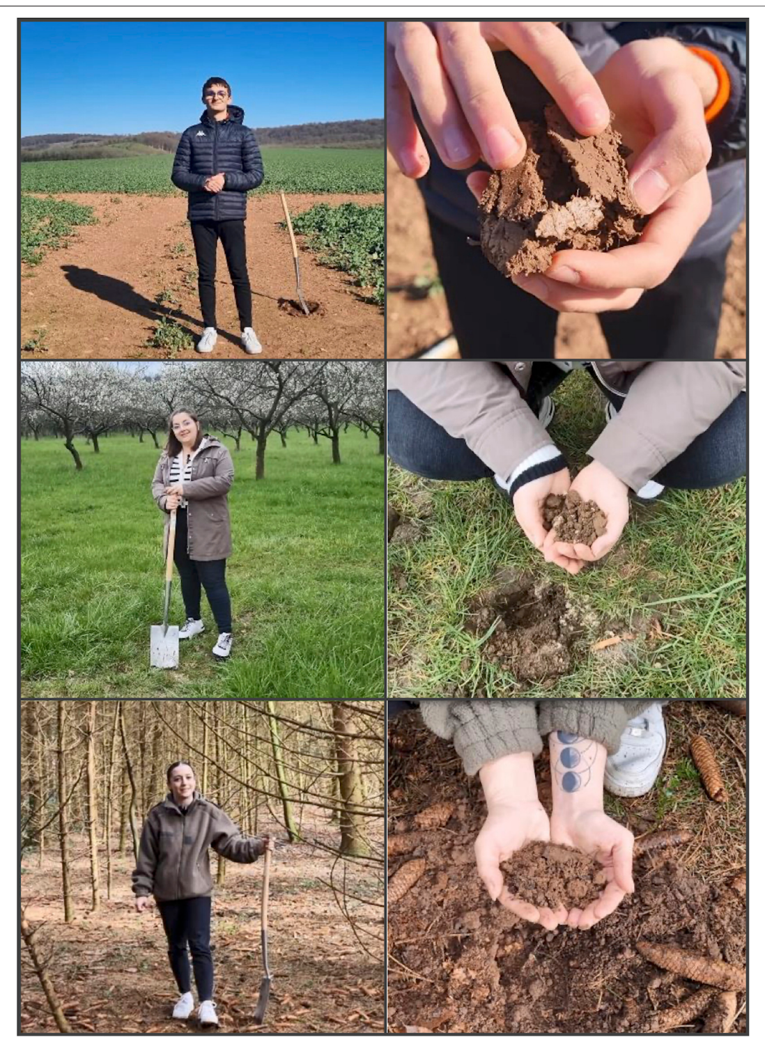
FIGURE 2 | Screenshots of the video showing three types of occupation (left) and their corresponding soils (right).

made of?", "Where do we get our cotton?", "Where does the wood we put in the stove, or the wood that makes up part of our houses, come from?" The aim of this question-and-answer game is to have pupils make the link between ecosystem services (food