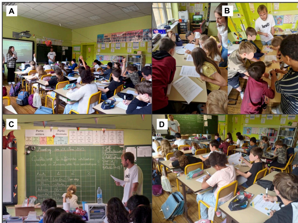
FIGURE 3 | In-class activities. (A) Correction of the grid. (B) Observations and manipulations. (C) Synthesis on the board. (D) Distribution of the diploma.

(that can be translated as “It’s not rocket science”), which deals with science popularization for children. The video shows three types of land use in Lorraine (field, orchard, and forest) and describes the three related soils in terms of color, texture, etc. (Figure 2). As the video is shown, pupils fill in a questionnaire to help them identify important information (the soil under forest cover is sandy, for example). At the end of the viewing, students proceed with a correction to check that the correct information has been recorded (Figure 3A).