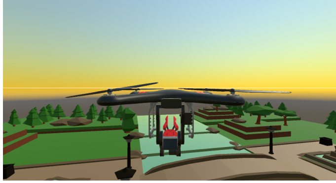
FIG. 1 – Teleoperated UAV in Unity.

first code generates the necessary force to be applied on each rotor to get the desired attitude (\phi, \theta, \psi) . The desired attitude leads to the desired position values from Gazebo. This virtual environment in Unity3D is a recreation of the real world where the aerial manipulator is moving.