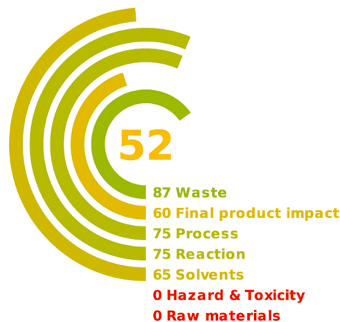
Fig. 2. GREEN MOTION™ assessment of N -butyl- N -ethylpiperidinium bis(trifluoromethanesulfonyl)imide synthesis.

Environmental Factor (E-factor) - mass of waste/mass of product (kg waste per kg product) - and Reaction Mass Efficiency (RME) have been then calculated. E-factor that has been proposed by R. Sheldon (Sheldon, 1992; Sheldon, 2017) is the actual amount of waste produced in a process. It takes into account the waste of all the chemicals used, whether for synthesis but also for the various treatments. It takes the