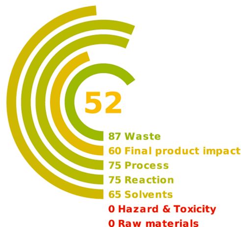
Fig. 2. GREEN MOTION™ assessment of N -butyl- N -ethylpiperidinium bis(trifluoromethanesulfonyl)imide synthesis.

Environmental Factor (E-factor) - mass of waste/mass of product (kg waste per kg product) - and Reaction Mass Efficiency (RME) have been then calculated. E-factor that has been proposed by R. Sheldon (Sheldon, 1992; Sheldon, 2017) is the actual amount of waste produced in a process. It takes into account the waste of all the chemicals used, whether for synthesis but also for the various treatments. It takes the