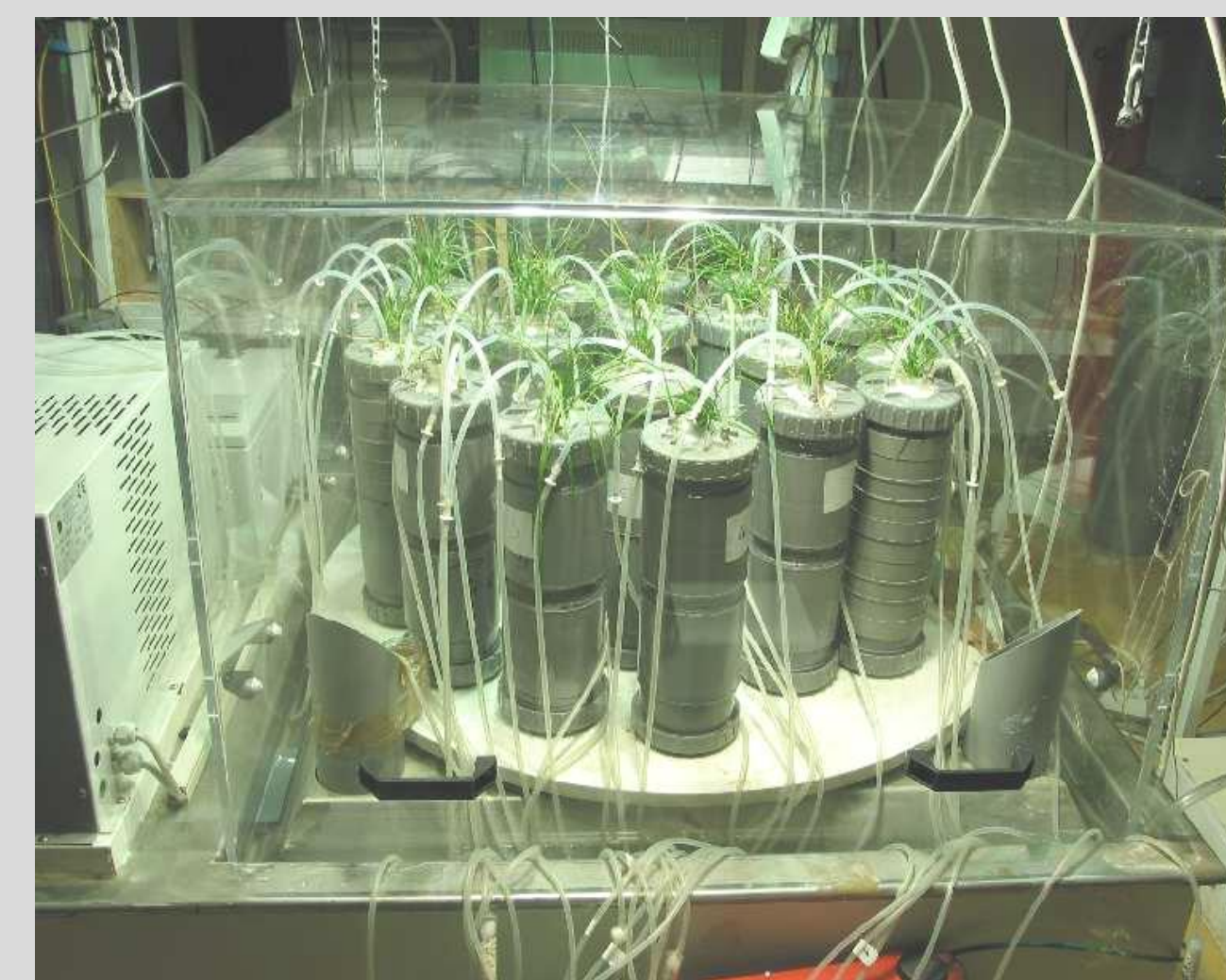
14 C labeling procedure