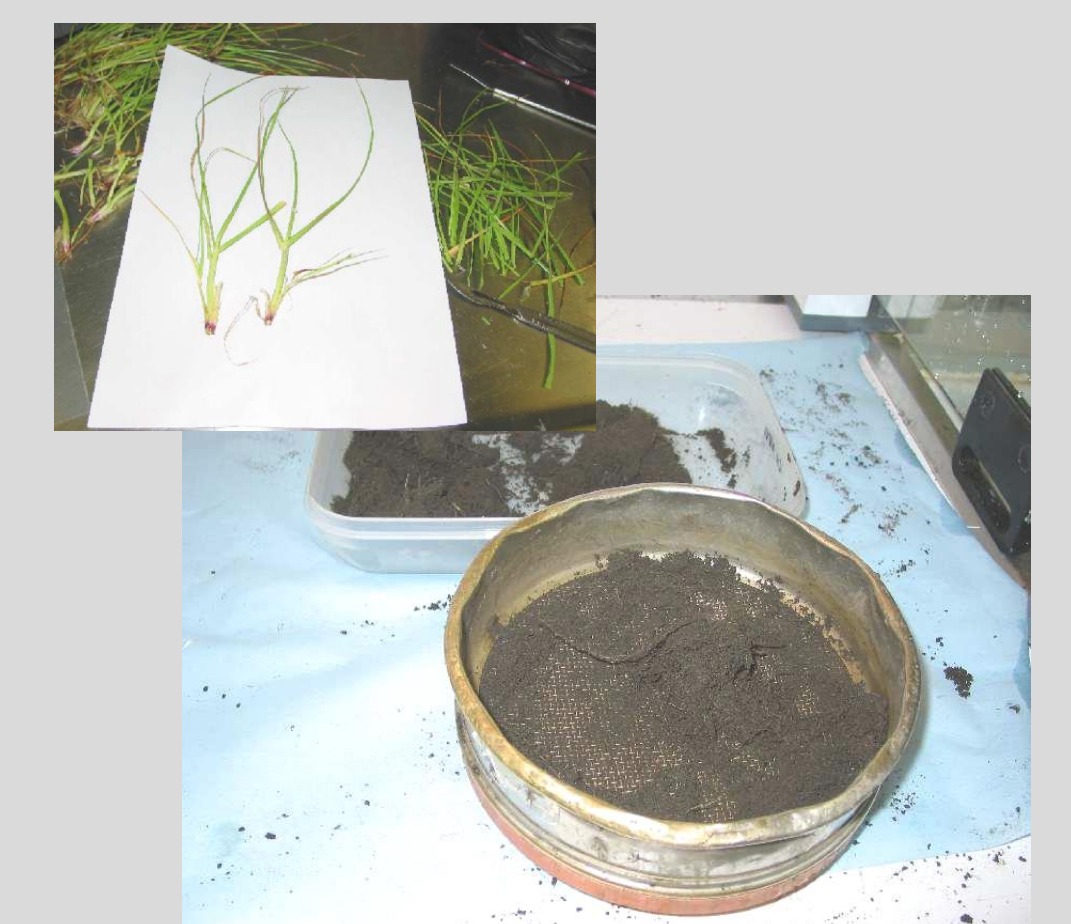
14 C labeling procedure